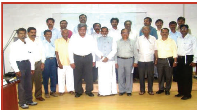
The Participants of the EDP for Ayurpark Health Care Ltd with the XIME Faculty

XIME was the venue for a two-day Entrepreneurship Development Programme for the members of Ayurpark Health Care Limited, an association of ayurvedic medicine manufacturers of Karnataka. It was a unique one because this was the first time a healthcare unit attended an EDP at XIME. Conducted by XIME on 29 th and 30 th January 2010, the 24 participants who attended the programme were manufacturers of ayurvedic medicines with a scale of operations ranging from Rs. 20 lakh to 5 crore. They opined that the programme was very beneficial for them as they were able to imbibe basics of marketing and finance, besides the vital entrepreneurial traits. They urged XIME to call them back later for an in-depth development programme spanning about a week so that they could be stronger in various business verticals which will facilitate an enhanced management focus through strategic thinking and business orientation to achieve sustained business growth.