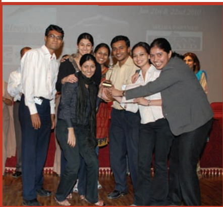
The team that won at the MCIM Fest