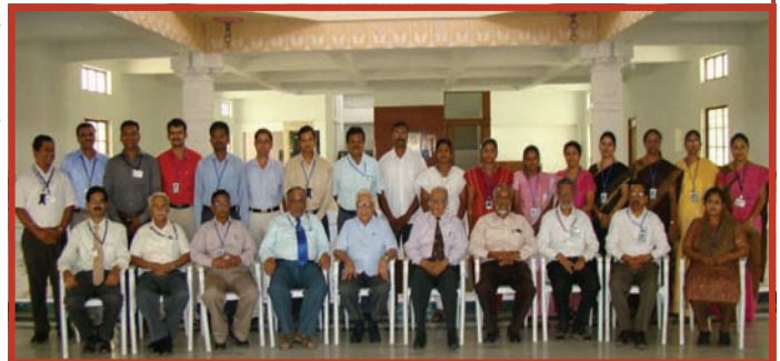
FDP Participants with the Faculty