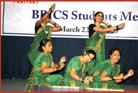
Lavani dance performance