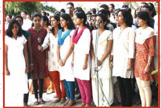
XIME students singing the National Anthem