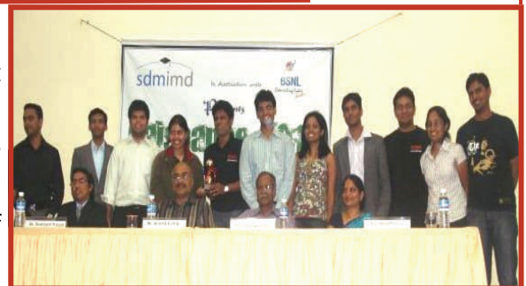
XIME - The Overall Champions at SDM, Mysore

XIME students bagged the Overall Championship at the SDMIMD Mysore management festival NAISSANCE, conducted during 29 th - 31 st January 2010. A team of twelve students represented XIME in the various events held during the fest which included games in the domains of Marketing, Finance, Operations, HR and Systems along with a B-plan and a Best Manager competition.