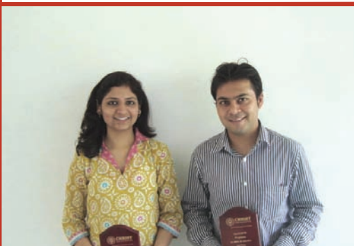
The XIME Winning Team