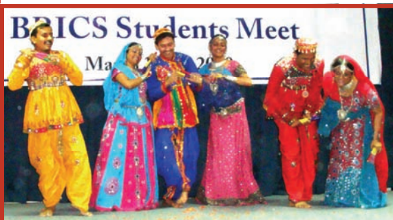
Dandiya Raas in progress

reflecting the truly international nature of the ABBS.