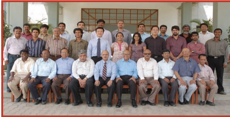
The Participants of the EDP with the XIME Faculty