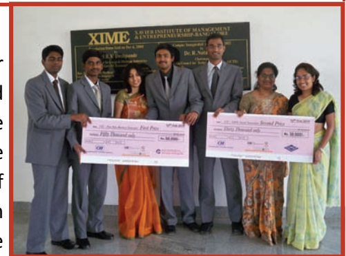
The XIME team at CII Innovator 2010, Chennai