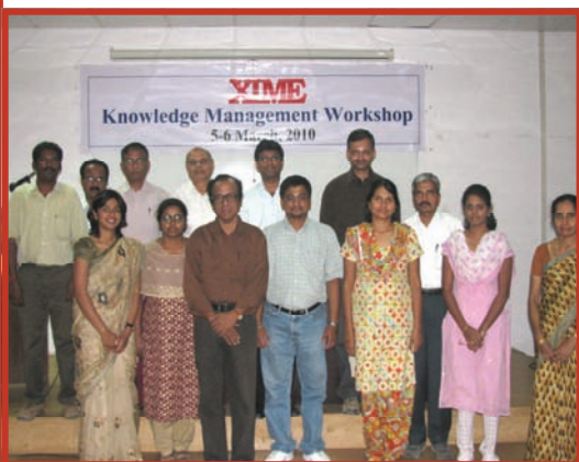
The Participants of Knowledge Management Workshop